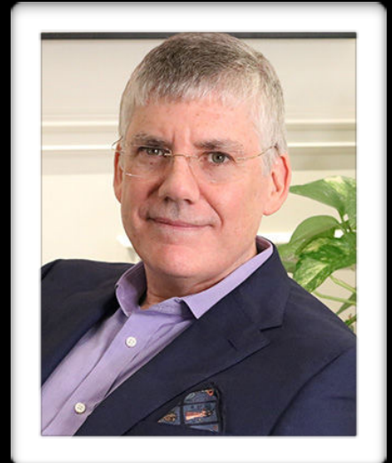
Rick Riordan, Author

Rick Riordan is the #1 New York Times bestselling author of over twenty novels for young readers, including the Percy Jackson book series. For fifteen years, Rick taught English and history at public and private middle schools in the San Francisco Bay Area and in Texas. While teaching in San Antonio, Saint Mary's Hall honored him with the school's first Master Teacher Award. Riordan turned to children's fiction when he started creating THE LIGHTNING THIEF as a bedtime story for his oldest son!